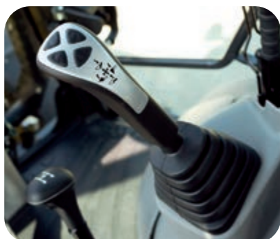
Convenient, ergonomic and precise control

A high-definition 7" LCD monitor provides excellent visibility. The high-definition LCD panel is less affected by the viewing angle and surrounding brightness, ensuring excellent visibility. Various alerts and machine information are displayed in a simple format. Useful information such as operation records, machine setting and maintenance data are also provided. The operator can easily navigate through screen pages with intuitive side buttons.