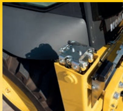
Anti-burst valves for stabilizers, boom and arm (Standard)