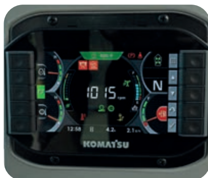
7" multi-function monitor